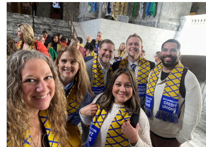
Advocating for credit union members at the Capitol