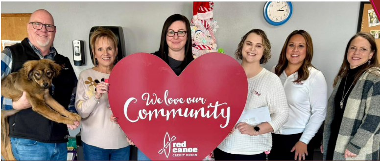
The staff donated $1,250 to the Cowlitz County Humane Society this year!