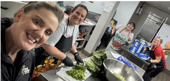
A team in Longview cooks dinner for Community House on Broadway.