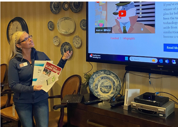
We made several visits to retirement homes to teach fraud awareness.