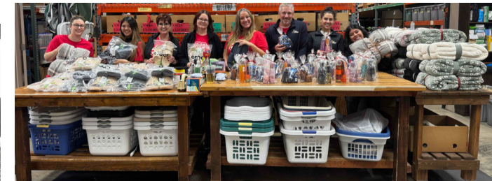
Putting together personal items and supplies for St. Francis House in Puyallup