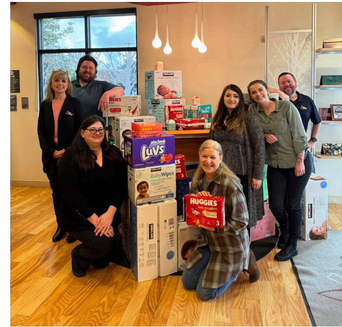
The Albany branch supports the annual Diaper Drive for local families