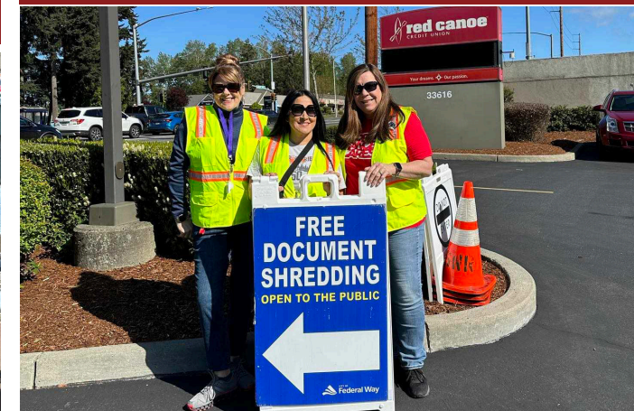
Free Shred Day in Federal Way