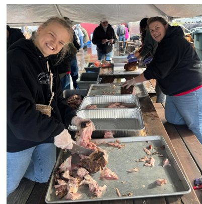
Our Woodland team helping at the free community dinner.