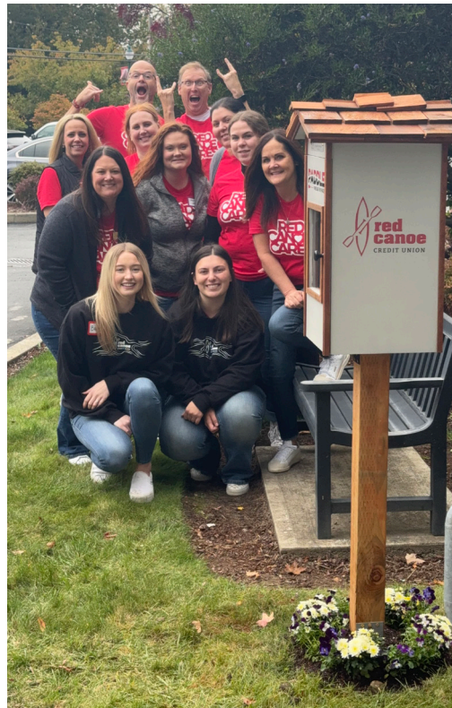
Red Canoe staff made and installed a Little Library at the Castle Rock Branch.